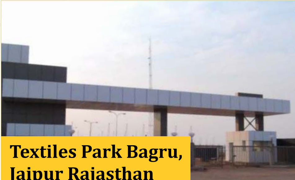
Textiles Park Bagru, Jaipur Rajasthan