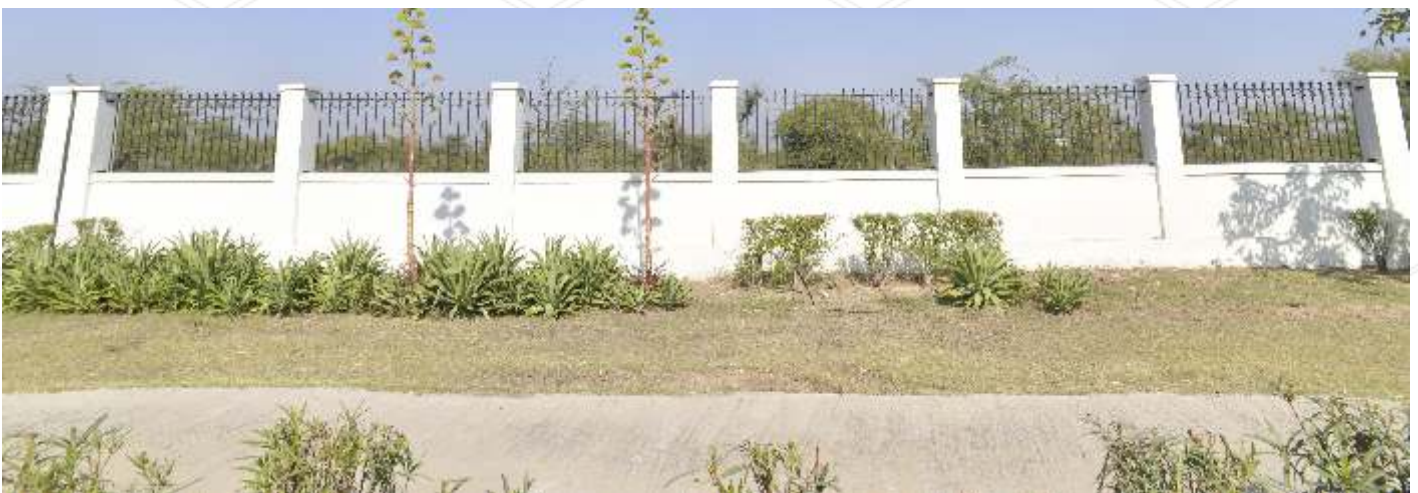
Civil Works for the boundary Wall